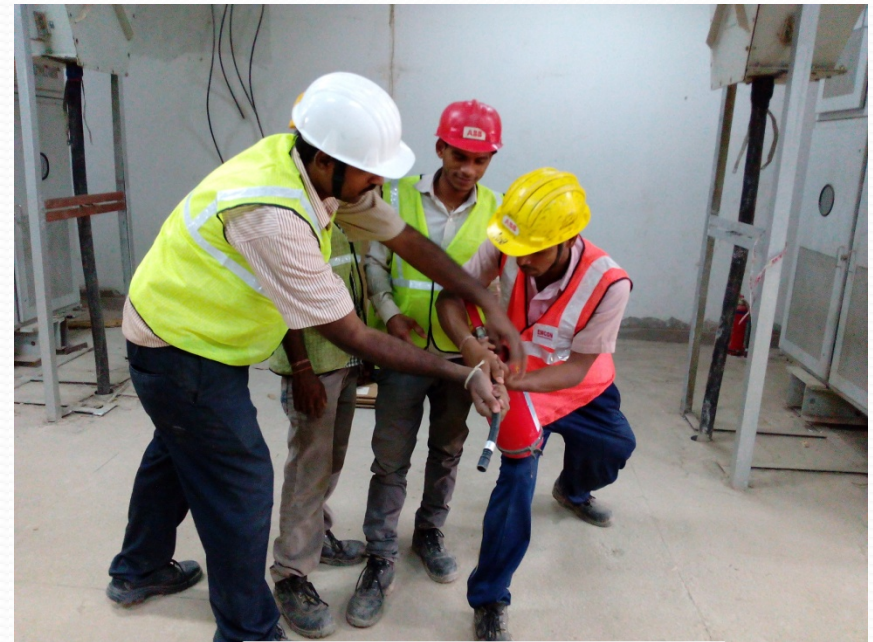
Fire extinguisher Handling training