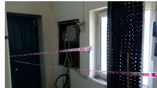
Isolating Hazardous area