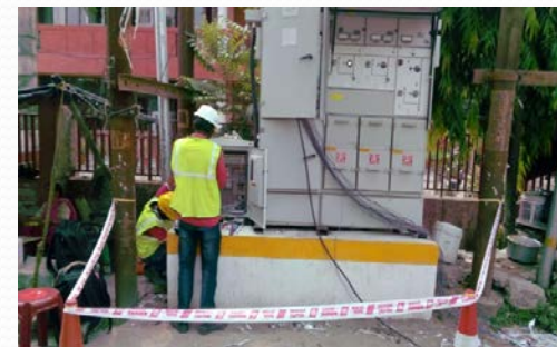
EHS at work place