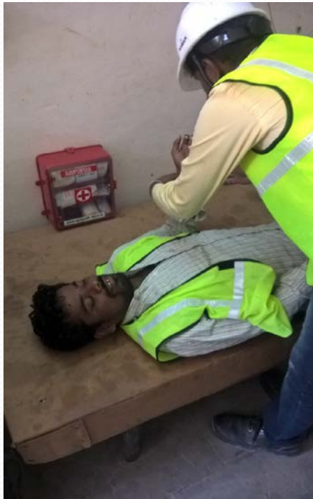
First aid demo at site